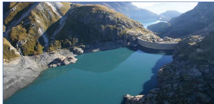
Reservoirs of a Pumped Storage Power Plant

A new test rig specifically designed to investigate hydro acoustic phenomena is underway. Hydrodynamic instabilities are produced by a flow past a semi cylinder. A set of piezo resistive pressure sensors will be installed all along the circuit to allow for pressure waves monitoring. At the same time, numerical simulation of the