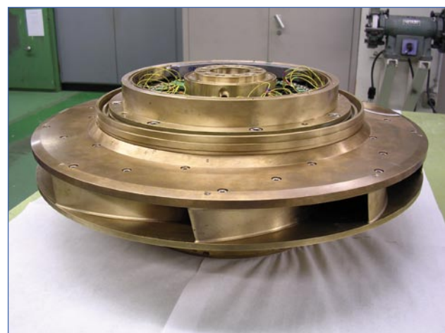
Instrumented pump turbine runner.